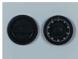
Mechanical combination lock